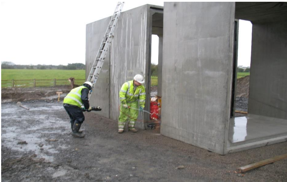
Each individual box had to be heated prior to installations of watertight seals