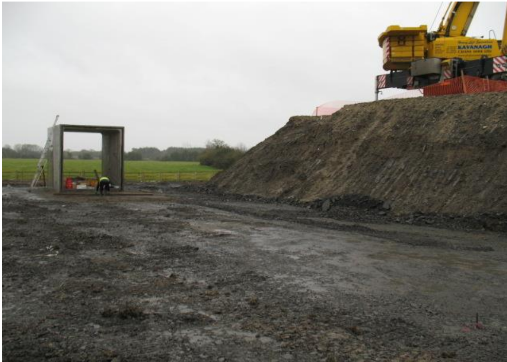
The installation of 2.5m x 3m box culvert for Dunboyne side road M3 motorway

Our previous experience of culvert installation was the M3 Motorway project which was for over 3 years with a value of over €5 million. It entailed both Plant Hire and Contract price work for Drainage and earthworks along with 5 No. culverts. The client was for SIAC/Ferrovial, and consisted of 5 underpass Box Culverts, 15no. 1800mm to 2100mm Pipe Culverts, 2,500 meters of mammal under passes 35,000 meters of drainage along with 2,500 meters of V-Ditches and 58,500 meters of 4 to 6 way ducting.