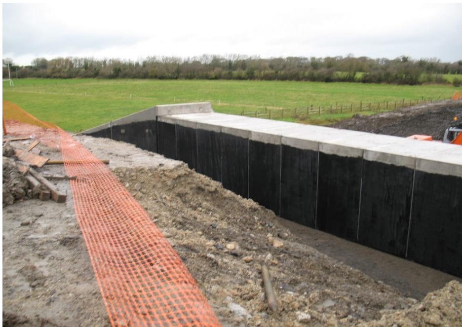
All exterior waterproofing was completed by ourselves, by hand application.