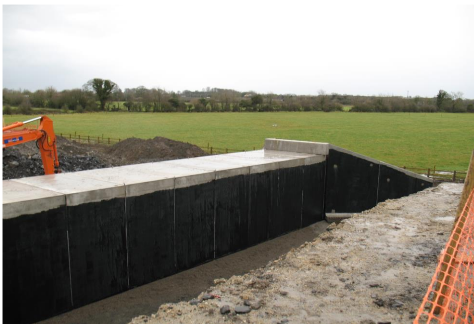
Back of wall drainage ready for installation.